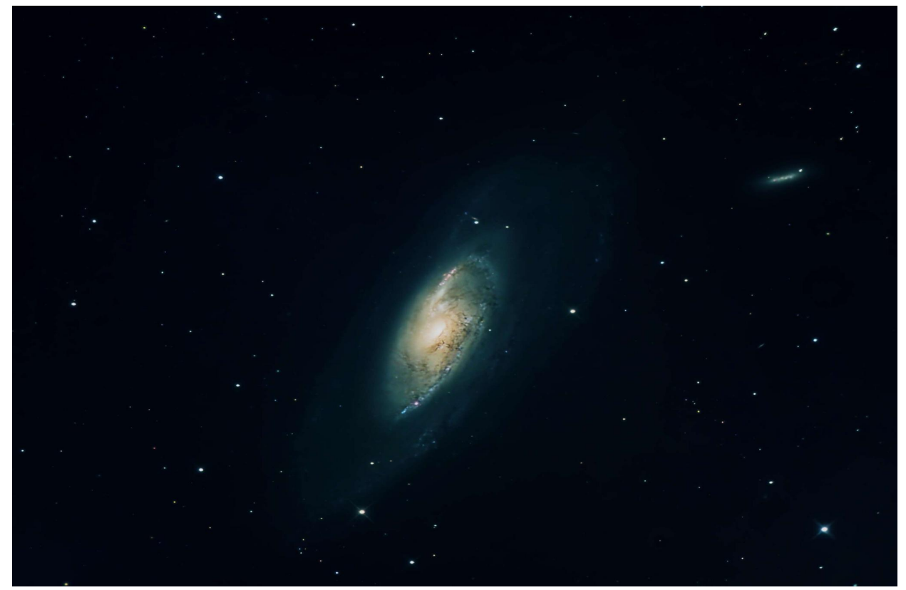
CCAS member Frank Widmann took this photo of M106 (also known as NGC 4258). Located 24 million light-years away in the constellation Canes Venatici, this intermediate spiral galaxy is visible high in the sky through Spring with even a small telescope.