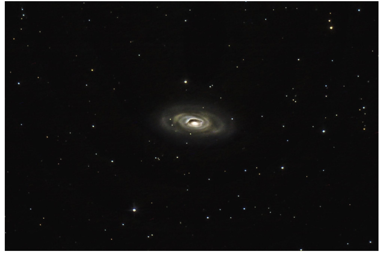
Robin White took this image of the Black Eye Galaxy (M64). Most visible in Spring through a moderately sized telescope, this galaxy is 17 million light-years from Earth in the constellation Coma Berenices.

Central Coast Astronomical Society PO Box 1415 San Luis Obispo, CA 93406 Website: <u>CentralCoastAstronomy.org</u> Facebook: <u>facebook.com/CentralCoastAstronomicalSociety</u>