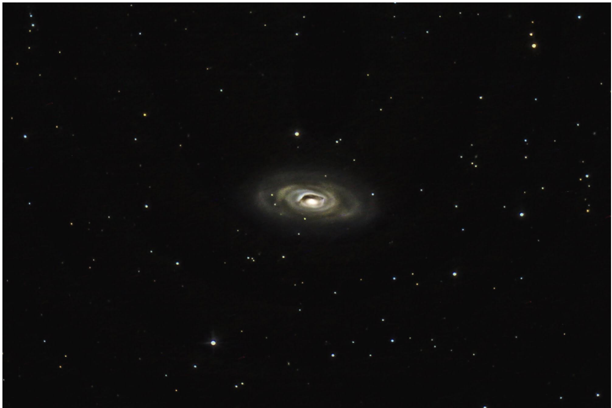
Robin White took this image of the Black Eye Galaxy (M64). Most visible in Spring through a moderately sized telescope, this galaxy is 17 million light-years from Earth in the constellation Coma Berenices.

Facebook: facebook.com/CentralCoastAstronomicalSociety